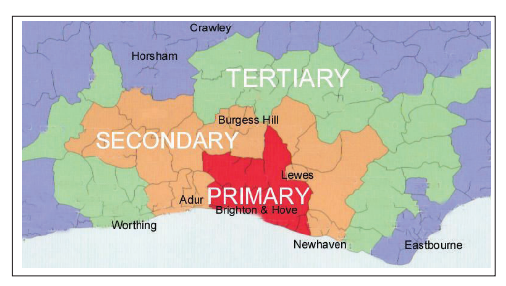
Brighton & Hove retail catchment areas

10. Brighton & Hove has a limited 180° catchment area. To supply sufficient consumers to service our retailers, we must attract them from greater distances than competing towns with a 360° catchment. But weekend intra-city transport links are often disrupted and the absence of a park &