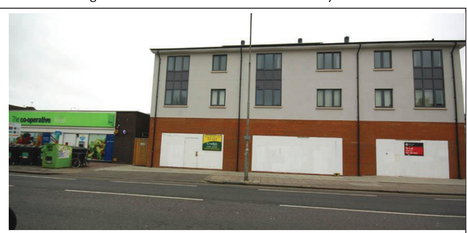
Does Lewes Road really need three more retail units on the site of the old petrol station?